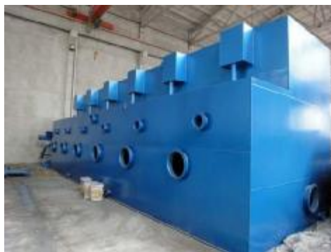
Workshop production-FJ model