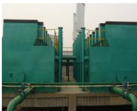
Jianguyin Waterworks in China