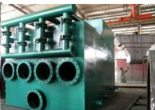
Special-shaped equipment (over sea)