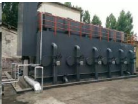
Water treatment in Congo textile mill