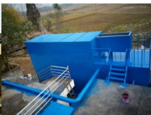
Rural water stations in Fujian, China