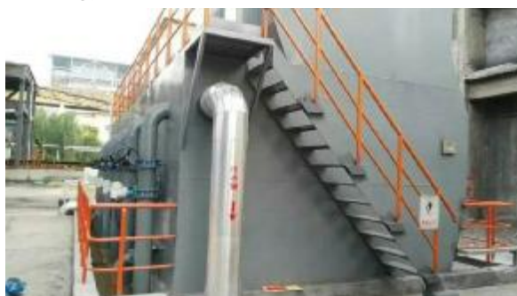
Electroplating plant in Sichuan, China