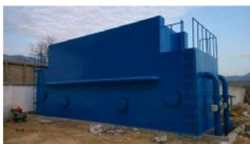
Rural water stations in Zhejiang, China