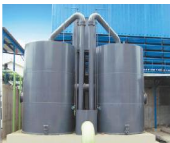
Traditional Automatic Valveless Gravity Filters