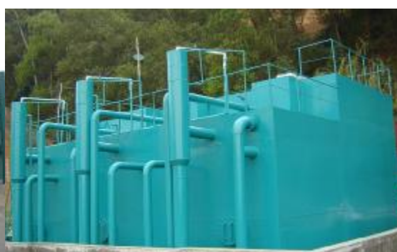
Taiwan mountain water station