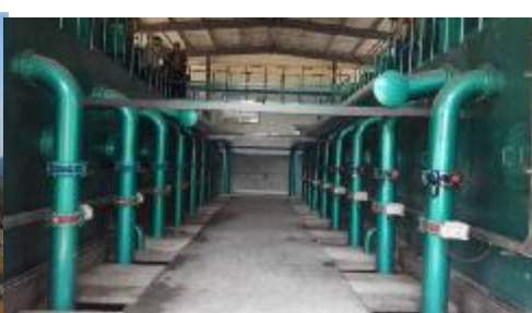
China Jiangxi paper mill