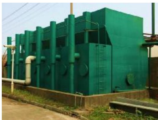
Vietnam dyeing and printing plant