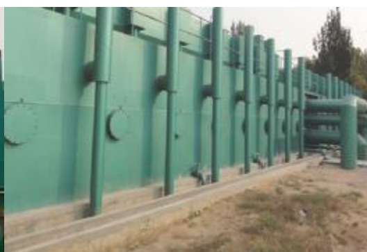
China Gansu Waterworks